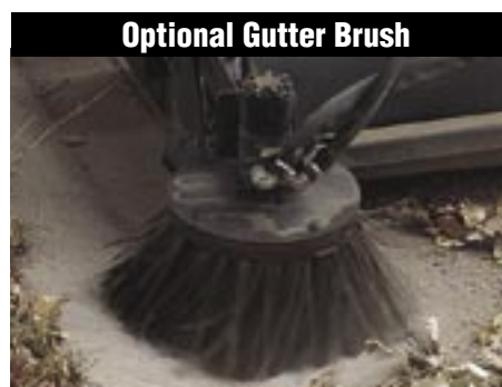
Optional Gutter Brush

Clean hard-to-reach areas — curbs, drainage depressions, alongside buildings — with the optional Bobcat gutter brush attachment. It widens the sweeper's total width by one foot, to let you cover more area per pass. Large, metal bristles produce excellent cleaning action. When not in use, the gutter brush can be raised and stored vertically. The gutter brush may be installed on either side of the sweeper.